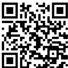
QR Code for Small Groups!