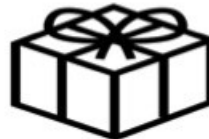
Increased through the matching gifts